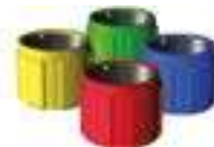
LK 32 RL ** For LK 32/25 LK 40 RL ** For LK 48/6 Items subject to Minimum Order Qty