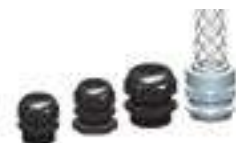
PG36 standard configuration. M63 for LK 48/6 and LK 32/25, PG42 for LK 32/25 on request and subject to Minimum Order Quantity. Mesh cable gland available.