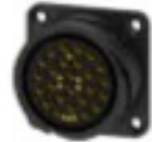
LK* 32/25+8R FP 25+8 poles