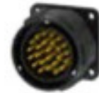
LK* 32/25+8R MP 25+8 poles