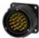
LK* 32/25+4R MP 25+4 poles